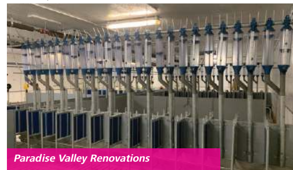
Paradise Valley Renovations

A2 Ventures Inc. completed the construction aspects of the renovations; Golf View Electric completed the electrical work; Summit Technology upgraded the Maximus ventilation controllers; After Hours Plumbing and Heating updated the heaters in the gestation room; and MK Painting helped give the barn a fresh coat of paint. We would like to thank everyone who helped us with the Paradise Valley renovations. Without all the long days and hard work, this project never could have been completed with such speed and efficiency.