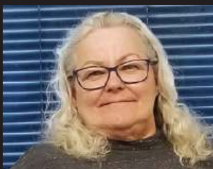
Windy Acres - Marion