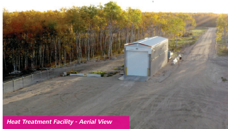
Heat Treatment Facility - Aerial View

Customers should feel reassured knowing that their animals are being transported on a trailer that has been cleaned and disinfected in the most secure and remote location available to date. It is truly the first of its kind! The site has given Steve's Livestock the ability to continue to offer biosecurity solutions to the highest health herds in North America.