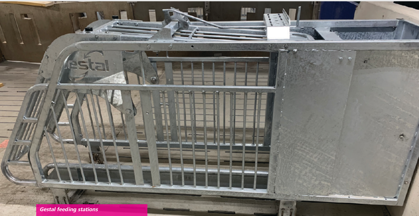
Gestal feeding stations

Hidden Valley Colony was established in 1968, located in the beautiful rolling hills five miles south of Austin, Manitoba. With a population of 140 people, they have developed many different agricultural enterprises such as grain cart manufacturing, a swine herd, a cattle herd, crops and more! While farming on 7,800 acres, Hidden Valley Colony has become well known for their excellent corn yields while their dairy cattle are known to be milked with state-of-the-art robotics.