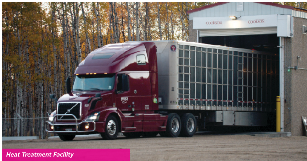
Heat Treatment Facility

After eight months of construction, the facility went into production on August 27, 2020. This new facility has the ability to heat treat approximately 32 trailers per day. One of the environmental improvements is