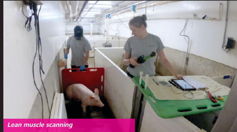
Lean muscle scanning