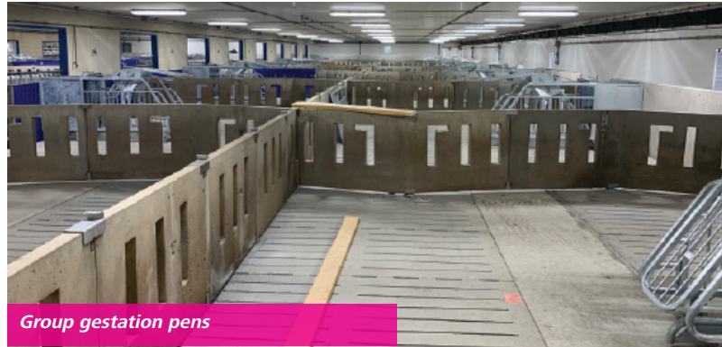
Group gestation pens

Each year Topigs Norsvin Canada presents an award in Eastern and