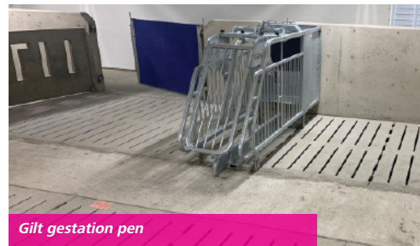
Gilt gestation pen

show the progress Hidden Valley Colony has made with Topigs Norsvin Genetics, but the staff notice the improvements too. "Those TN70s are doing all the work!" stated Jonah Kleinsasser (Farrowing Room).