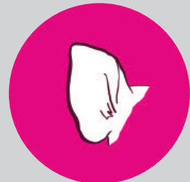
4. Immobility during back pressure test

For more optimizing reproductive success tips, speak with your Topigs Norsvin Business Development Representative.