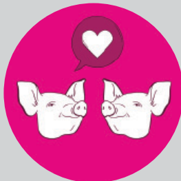
1. Interest in boars

During heat, sows and gilts display distinct behavioral and physiological changes that indicate their readiness to breed. Recognizing these signs is essential for optimizing reproductive success. Changes include: