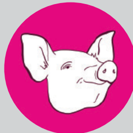
3. Immobility and non-vocal in the presence of the boar